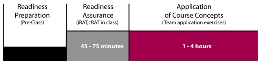
Figure 2: Typical Timeline for a TBL Unit

Following the readiness assurance process, each team is assigned the same application exercise to solve. Application exercises are designed such that students use the material they learned outside of class to solve challenging problems. Each team reveals their answer to the application exercise simultaneously, resulting in energetic conversation between teams, as each team seeks to justify their answer. Teams are held accountable for their work by providing verbal or written explanations of their answers to application exercises. While most learning occurs amongst students in their teams, faculty are always present and available to provide a “mini-lecture” over material that teams find difficult to master.