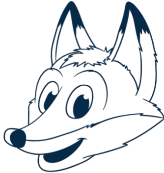
One Color (blue, black, white)

Regi's head and full body poses may be used in full color, two color or one color. Below are each color option depicted in the profile stand-alone face.