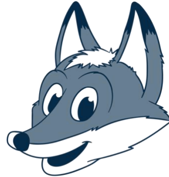
One Color Transparency (blue, black, white)