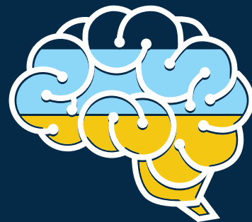
■ Master's Degree

▶ An expanded network: When you become a graduate student, you are exposed to a network of peers and faculty who are successful in their field. As a graduate of Regis, you will join a network of nearly 80,000 alumni.